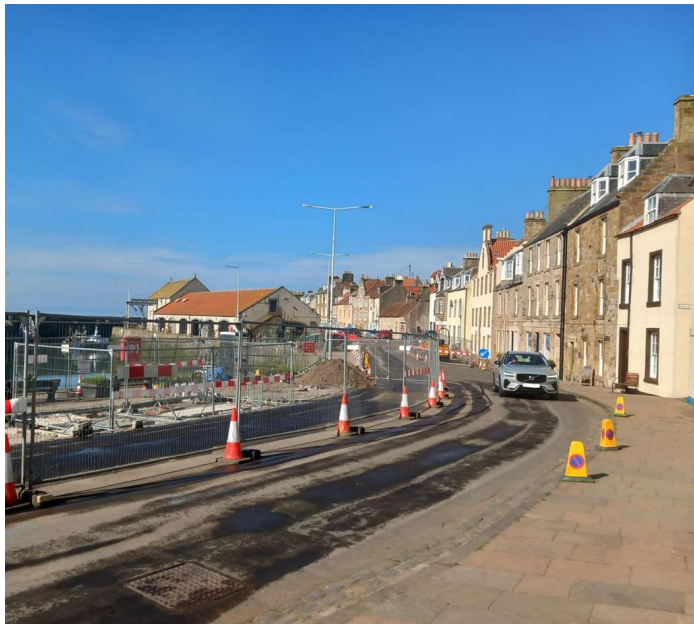
Image: Current East Shore Works

Parking: Our site cabins have now been moved away from Mid Shore and the Mid shore car park is now fully open for parking. Our site cabins are now located in the area to the rear of Pittenweem Cemetery.