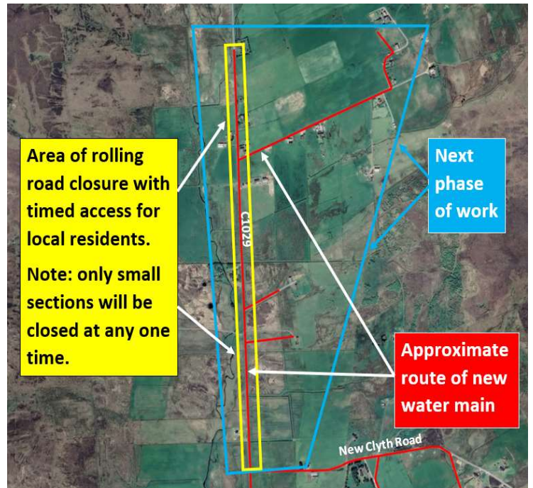
Image: Phase 2 road closure location.

For local resident access, there will be timed access each day at certain times during the road closure. Details of this are provided below.